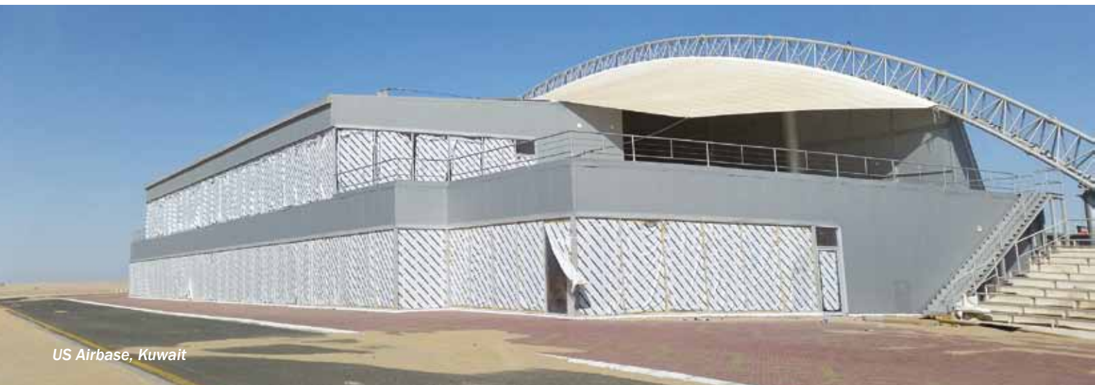
US Airbase, Kuwait