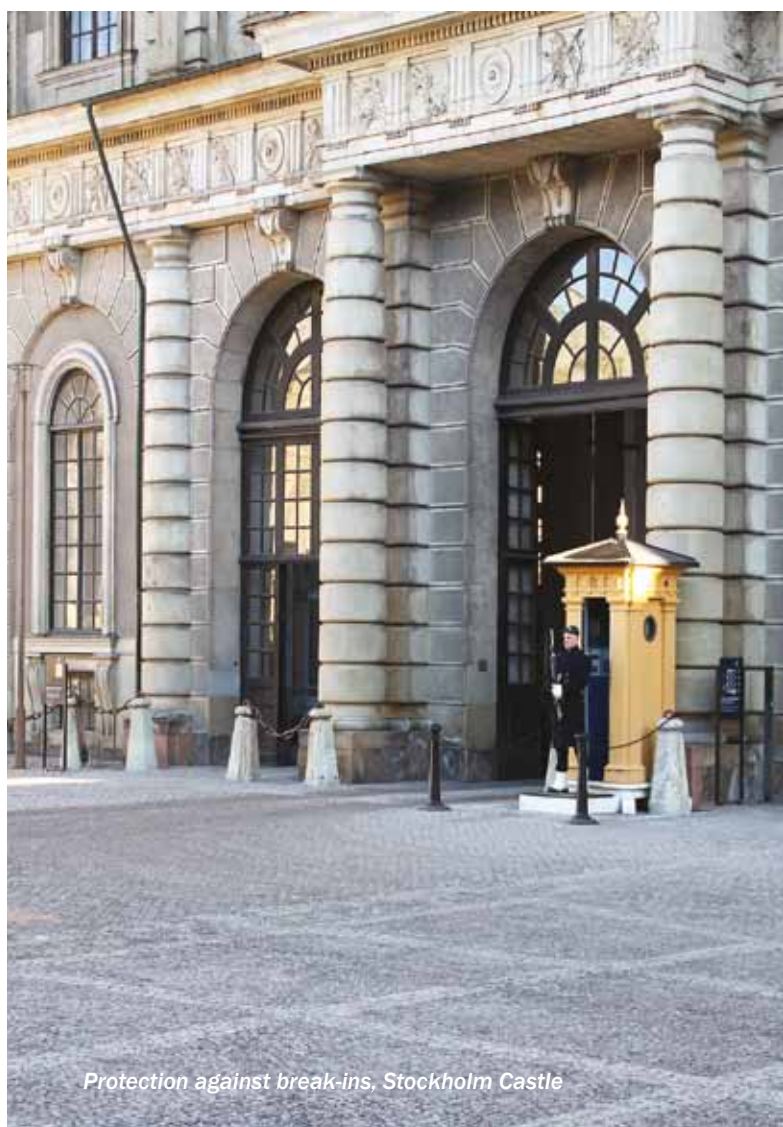
Protection against break-ins, Stockholm Castle