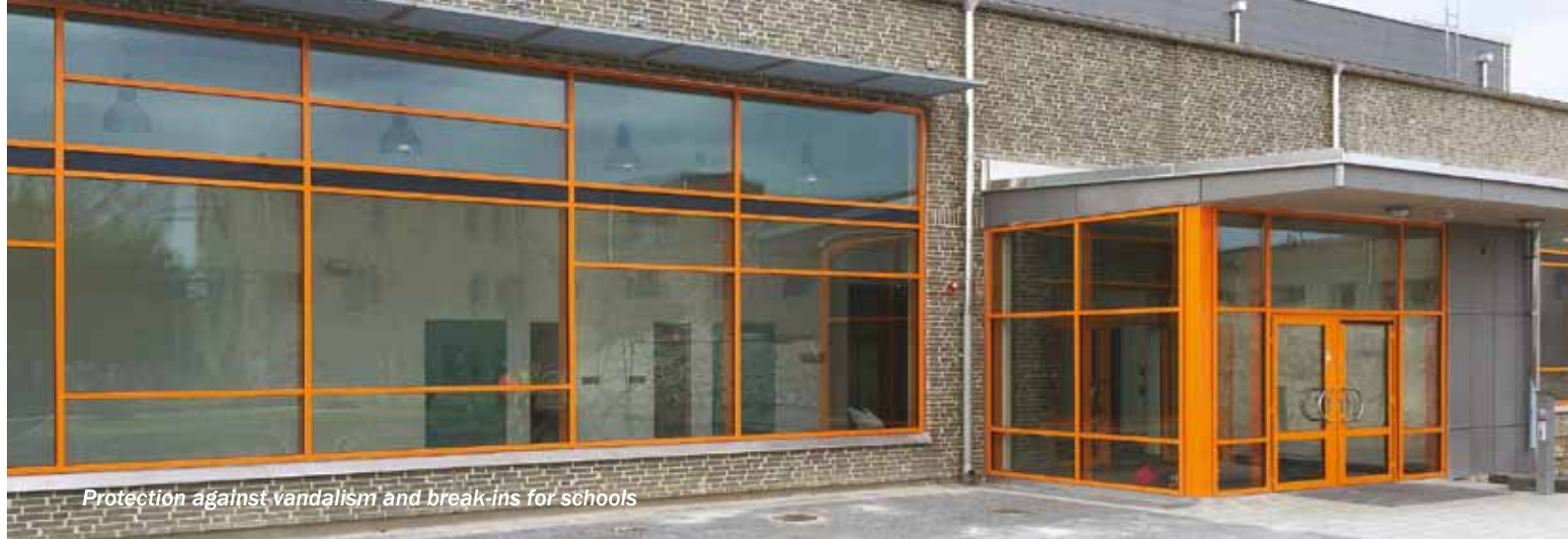
Protection against vandalism and break-ins for schools