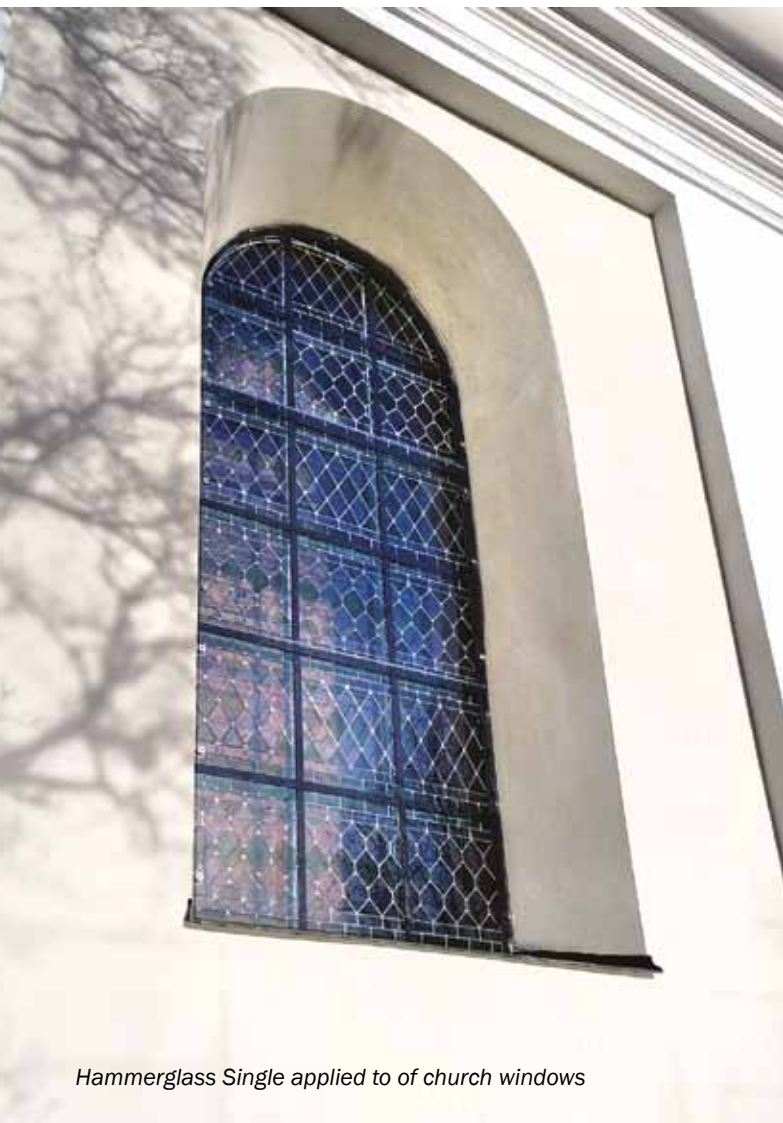
Hammerglass Single applied to of church windows