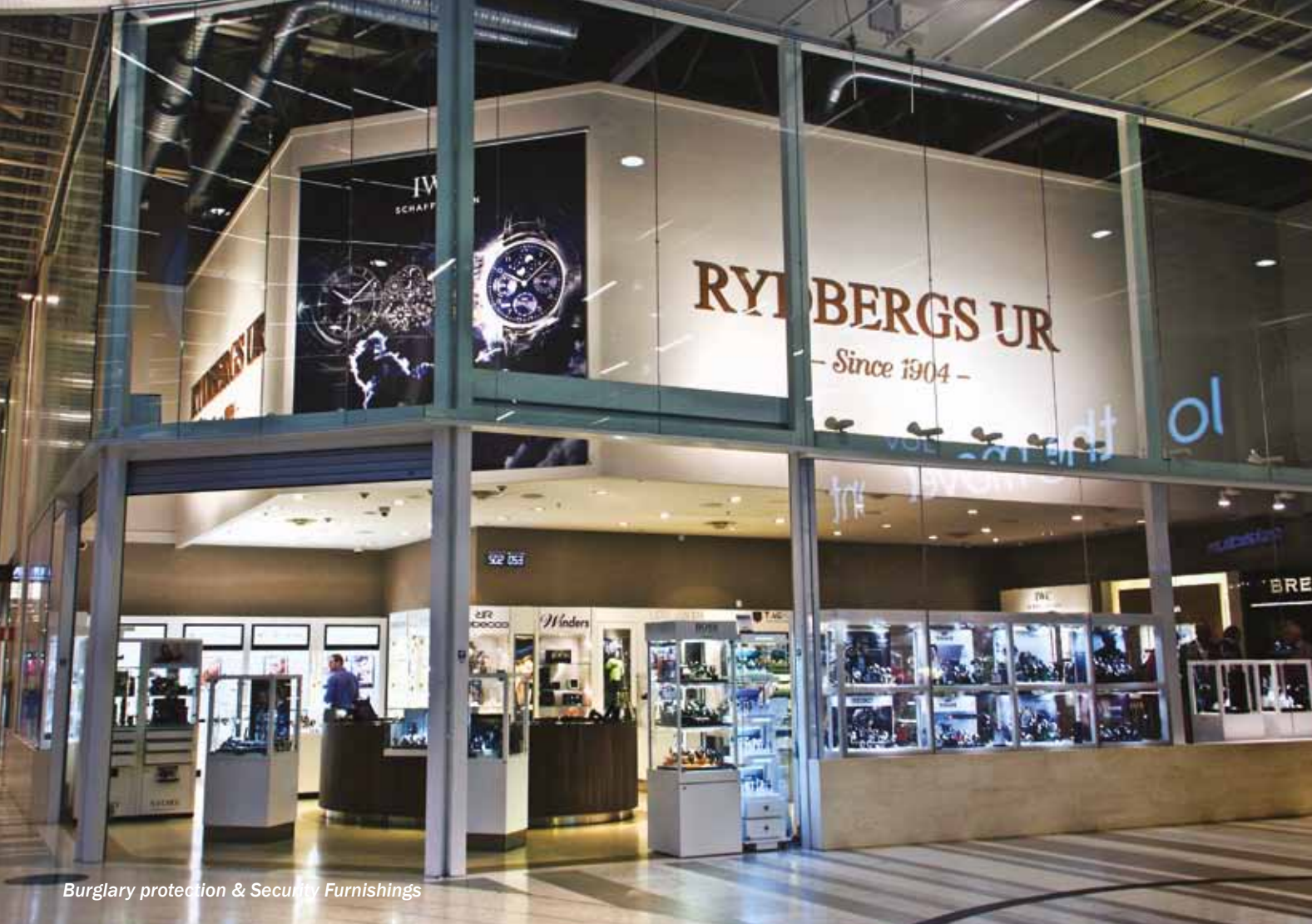
Burglary protection & Security Furnishings