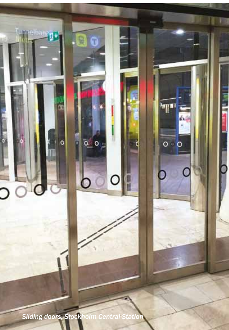
Sliding doors, Stockholm Central Station