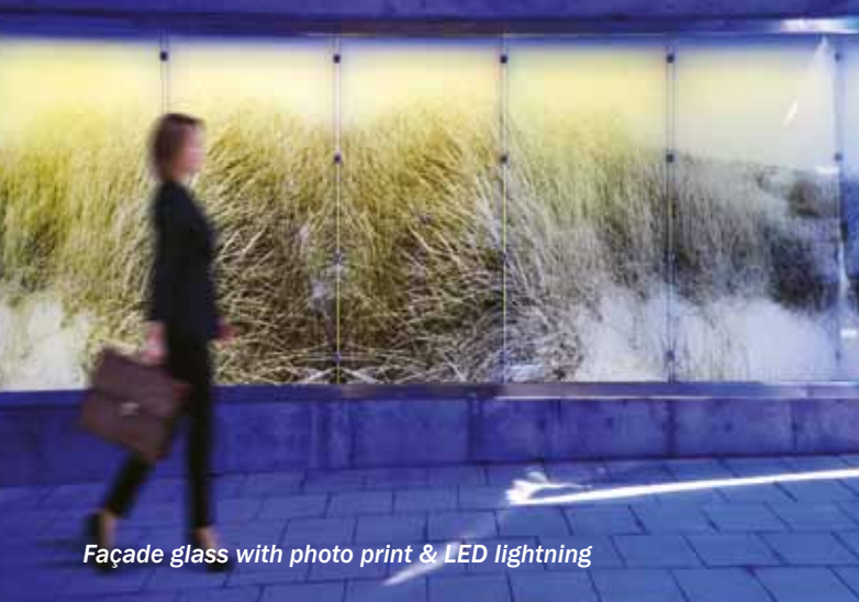
Façade glass with photo print & LED lightning