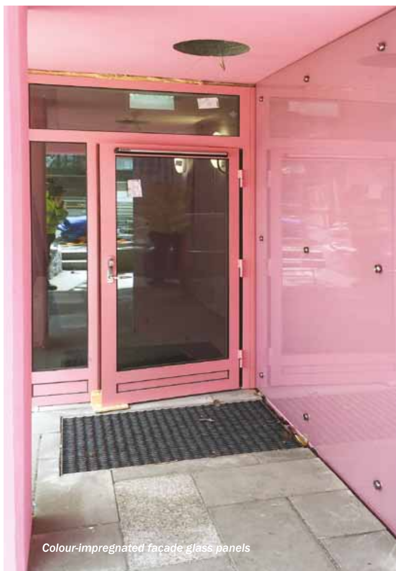
Colour-impregnated facade glass panels